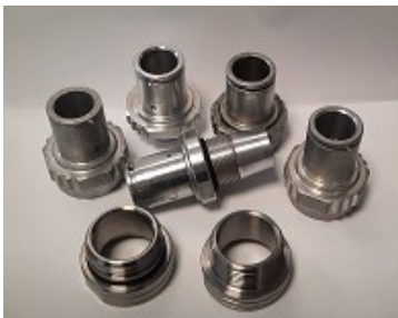
Mod. 230 & 230 SS